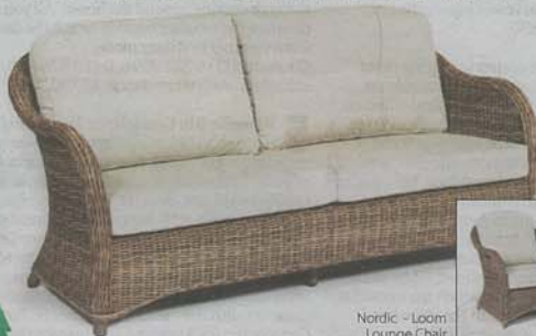
Nordic - Loom Lounge Chair

Our Nordic all weather 3 seater lounge is the perfect place to retire to this summer. Our Summer collection features all-weather cushions, fully guaranteed fade resistant outdoor/indoor loom in a raft of brilliant and subtle designer colours. Visit our showroom or web site to fully appreciate how you can make the most of your outdoor living this summer. Available for Christmas delivery.